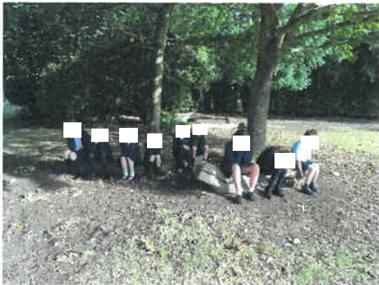
Us with no new playground