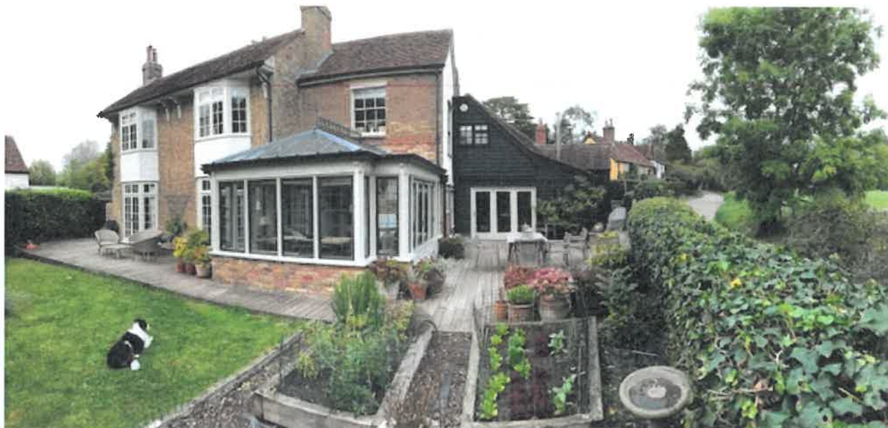
The house as it looks today .....