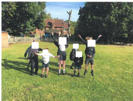
Us if you say yes